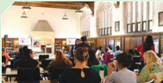
Nearly 80 healthcare professionals attended Stronger Together, Cancer Health Equity Summit presented by Wellness House in partnership with UI Health on the campus of the University of Illinois-College of Medicine. This special event united cancer health equity leaders across Chicago to share new findings and collectively shine a light on solutions to address inequities in cancer care through expert speakers and interactive workshops.