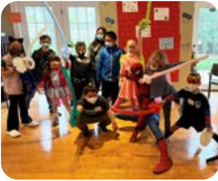
Superhero Day Saturday, April 27 10:00 - 11:30 am Staff Registration Required

Superhero Day is a day to celebrate all superheroes, but especially our youngest who are impacted by or fighting cancer. Dress in your favorite superhero costume or attire; we will have yummy treats, superhero crafts and lots of family fun. The morning will include a visit by a surprise superhero too!