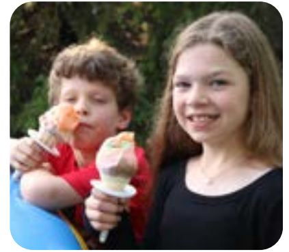
Hope Social: Kids Corner Thursday, June 6 5:00 - 7:00 pm Registration Required

Location: 6445 W North Ave, Oak Park, IL 60302