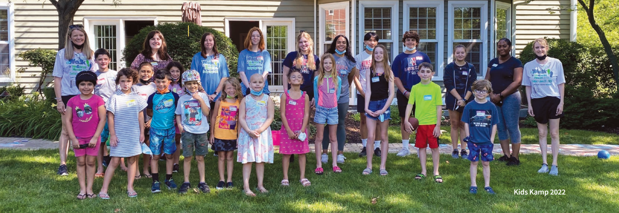
Kids Kamp 2022